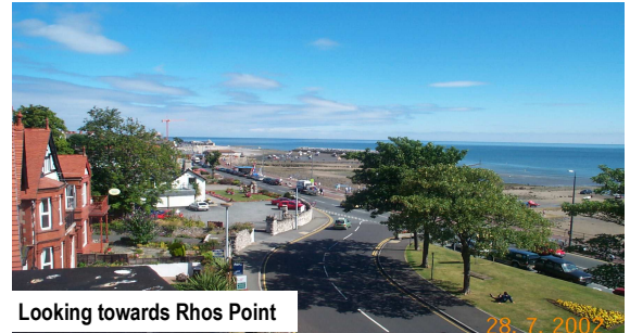
Looking towards Rhos Point